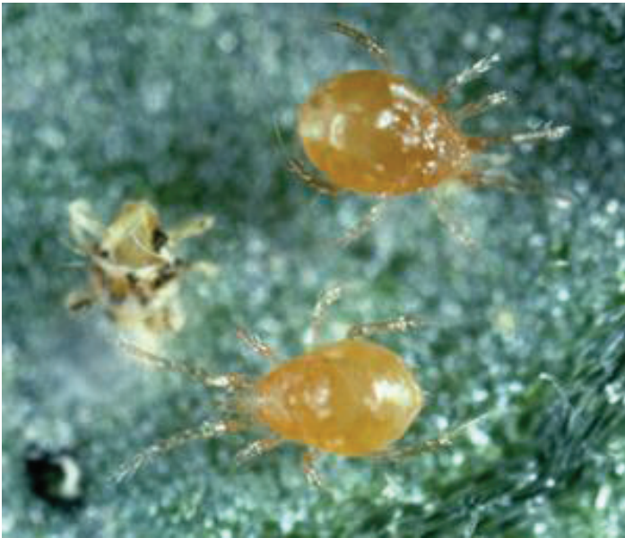
Figure 4. Predatory mites like Neoseiulus californicus (Figure 4a) and Phytoseiulus persimilis (Figure 4b) can be used to control plant-damaging mites.