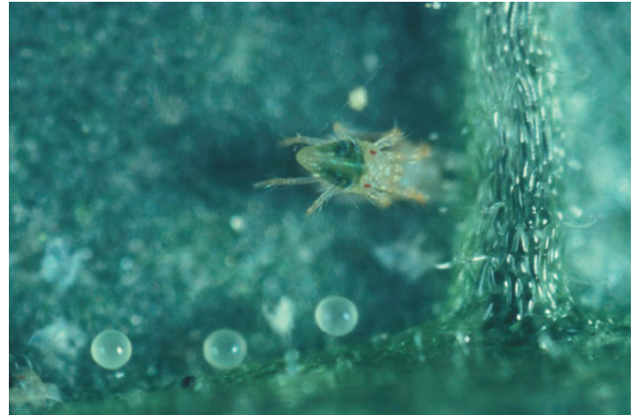
Figure 1. A male twospotted spider mite ( Tetranychus urticae ) and eggs on underside of a leaf

Eriophyid mites ( Eriophyidae family) are too small to be seen with the naked eye (Figure 2) and include bud, gall, purple tea and rust mites, among others. As their names