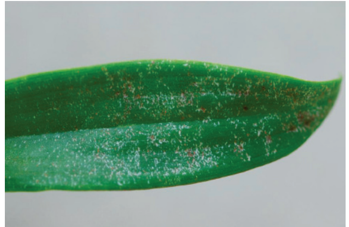
Figure 3. Stippling due to flat mite feeding on an orchid leaf

stems firmly on a light-colored surface, such as a white painter's palette or a sheet of white paper on a clipboard. If mites are present, they will be easily seen as small, moving spots.