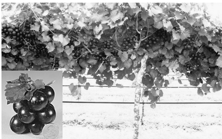
Fig. 1. ‘Southern Jewel’ muscadine grape.

Symptoms of Pierce’s disease have not been observed in ‘Southern Jewel’. Fruits are highly resistant to ripe rot [ Colletotrichum gloeosporioides (Penz.) Penz. & Sacc.], bitter