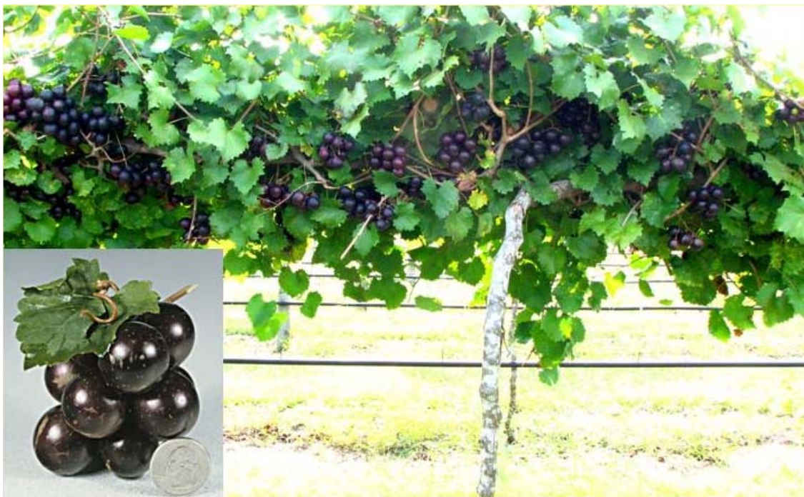
‘Southern Jewel’ Muscadine Grape

‘Southern Jewel’ is a new muscadine grape cultivar being released by the University of Florida that is a high-yielding, disease resistant large black-fruited variety. It has the unique characteristic of producing fruit in bunches of 6 – 12 berries that strongly adhere to the stem. It has excellent taste and a crunchy texture, with a palatable skin, making it well-suited for fresh fruit consumption.